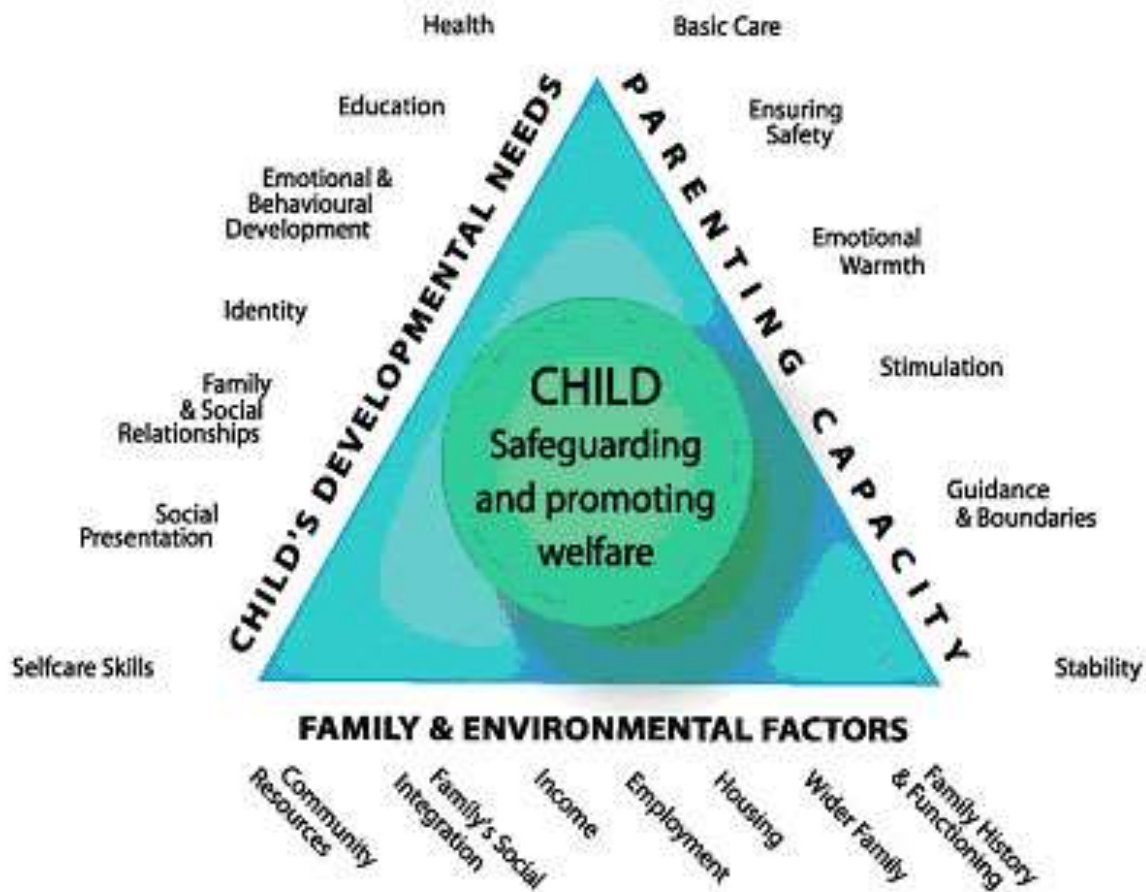
Figure 1 – The Assessment Framework 50